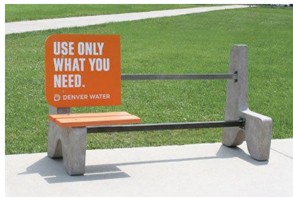
3. Denver Water