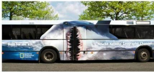
3. National Geographic ad for the program, “Built for the Kill” (vehicle wrap)