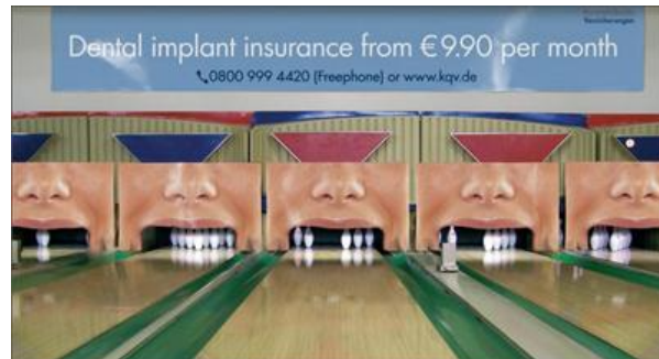
1. Dental implant insurance – bowling alley

A. Look at the examples of the guerilla warfare strategy.