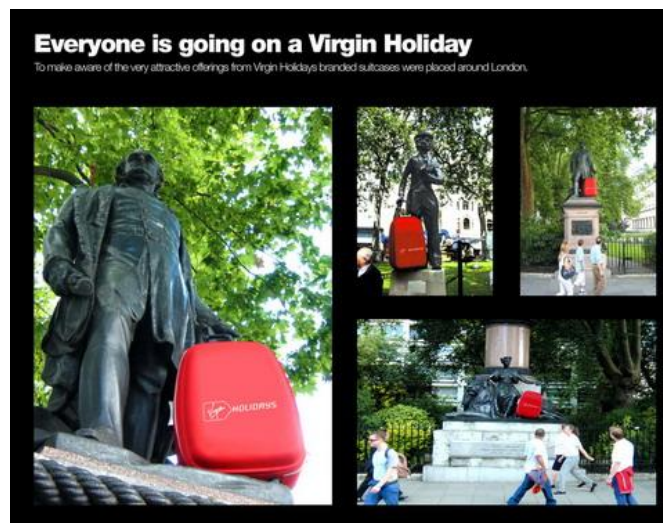
2. Virgin (branding)