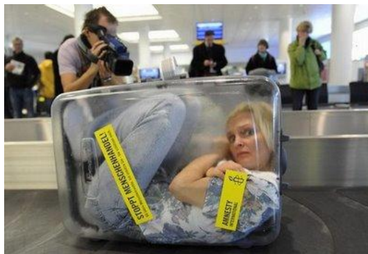
6. Amnesty International (human trafficking awareness campaign)