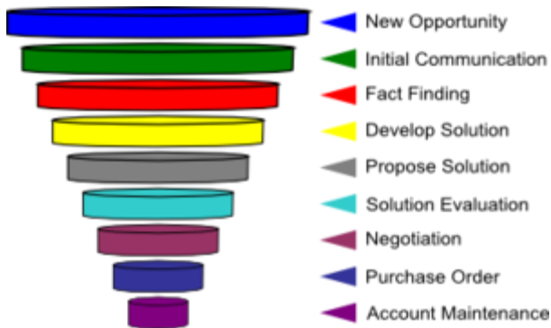
Sales funnel layers

A sales funnel is constructed by stacking several layers together. Typical layers include: