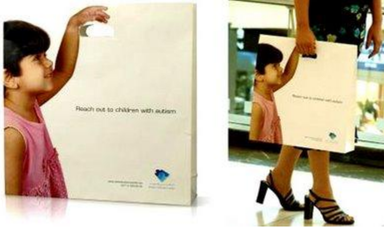
7. Help a Child with Autism Campaign